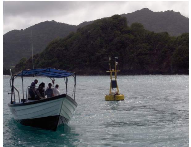
Group deploying buoy at Angel's Reef in Speyside, Tobago. This towable buoy allows for the flexible relocation or complete removal based on study needs or in preparation for severe weather events.