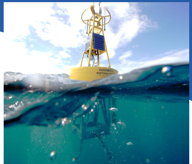
This coastal buoy supports a full array of water quality sensors, data acquisition systems, and meteorological sensors. Its hull and structure are rugged enough to withstand significant wind and wave activity in ocean applications in less than 75 meters of water depth.

Coral reefs play an extremely important role in the Caribbean economy for tourism as well as food production and food security. The regions’ unique reefs have been impacted by rising sea temperatures and pollution. Long-term monitoring of environmental conditions in the Caribbean will help researchers track the health of the reefs, among the oldest and most diverse ecosystems on the planet, and mirrors similar systems already installed at key reef sites in the Atlantic and Pacific Oceans. Data will allow development of climate